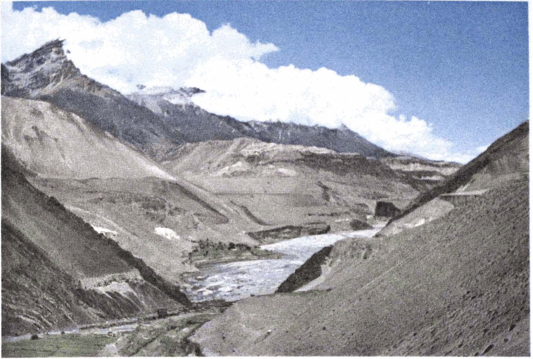
Fig. 4: The northern Kali Gandaki Valley, 2. 9. 67, 12.00 h local time, looking at north, location above Kagbeni, ca. 3100 m. (After DITTMANN, 1970: 56, Fig. 10).

only a high reputation in the eyes of the Tibetan people, but also among millions of human beings in central Asia. ZIMMER tries to show a way of understanding lamaistic medicine to the abstractly thinking westerners.