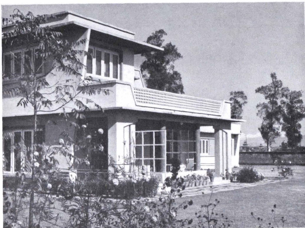
Fig. 2: Nepal Research Center, Kathmandu ("Thyssen House").

of a "NEPAL RESEARCH CENTER". Our plans met with the ready approval of his Majesty the King and the governmental departments concerned. We found a recently-built house, very suitable for our purpose, in Chauni, in the west of the city, and very close to the Museum. It has guest and social rooms, and offers ample opportunity for installing a library and laboratories; we shall also be able to take advantage of the large garden. We are again indebted to the FRITZ THYSSEN STIFTUNG for financing this institute, which as "NEPAL FORSCHUNGSINSTITUT" at the same time has its seat in the ZOOLOGISCHE STAATSSAMMLUNG MUNICH. The official opening took place in Kathmandu on 17 November 1965. H. R. H. the Crown Prince of Nepal, members of the ministries and of the German Embassy graciously took part in the ceremony (Fig. 2).